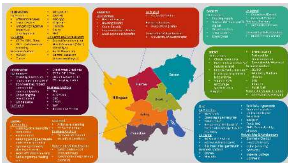
Figure 1 – West London Borough Priorities for Growth and Digital Business and Innovation Anchors

4.4 The scale and range of activity across the public and private sector means West London has a strong investment case for digital investment and transformation. Figure 1 provides an overview of the priorities for growth and digital business and innovation anchors. At the West London level important sector opportunities include: