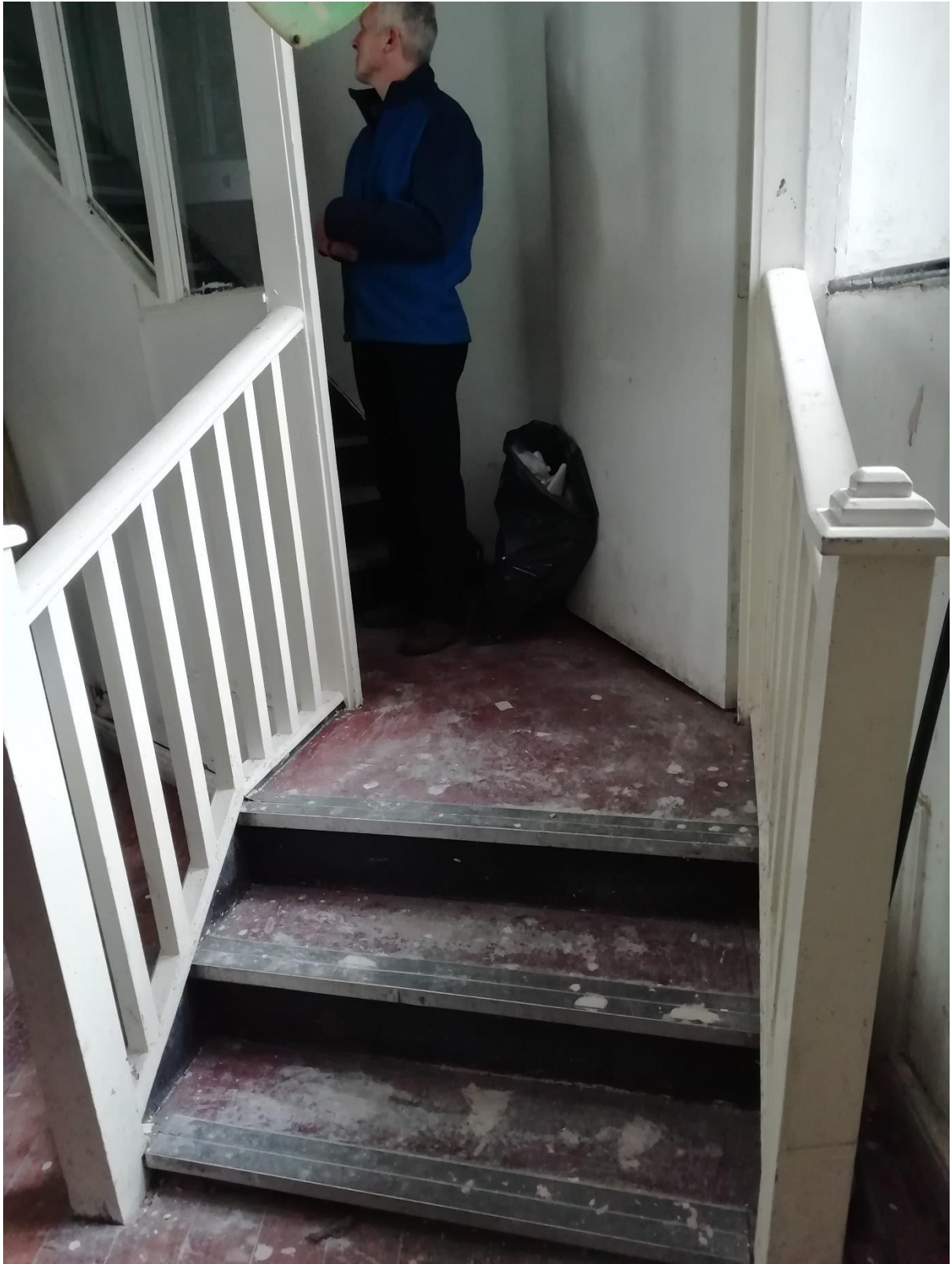
Base of the steps