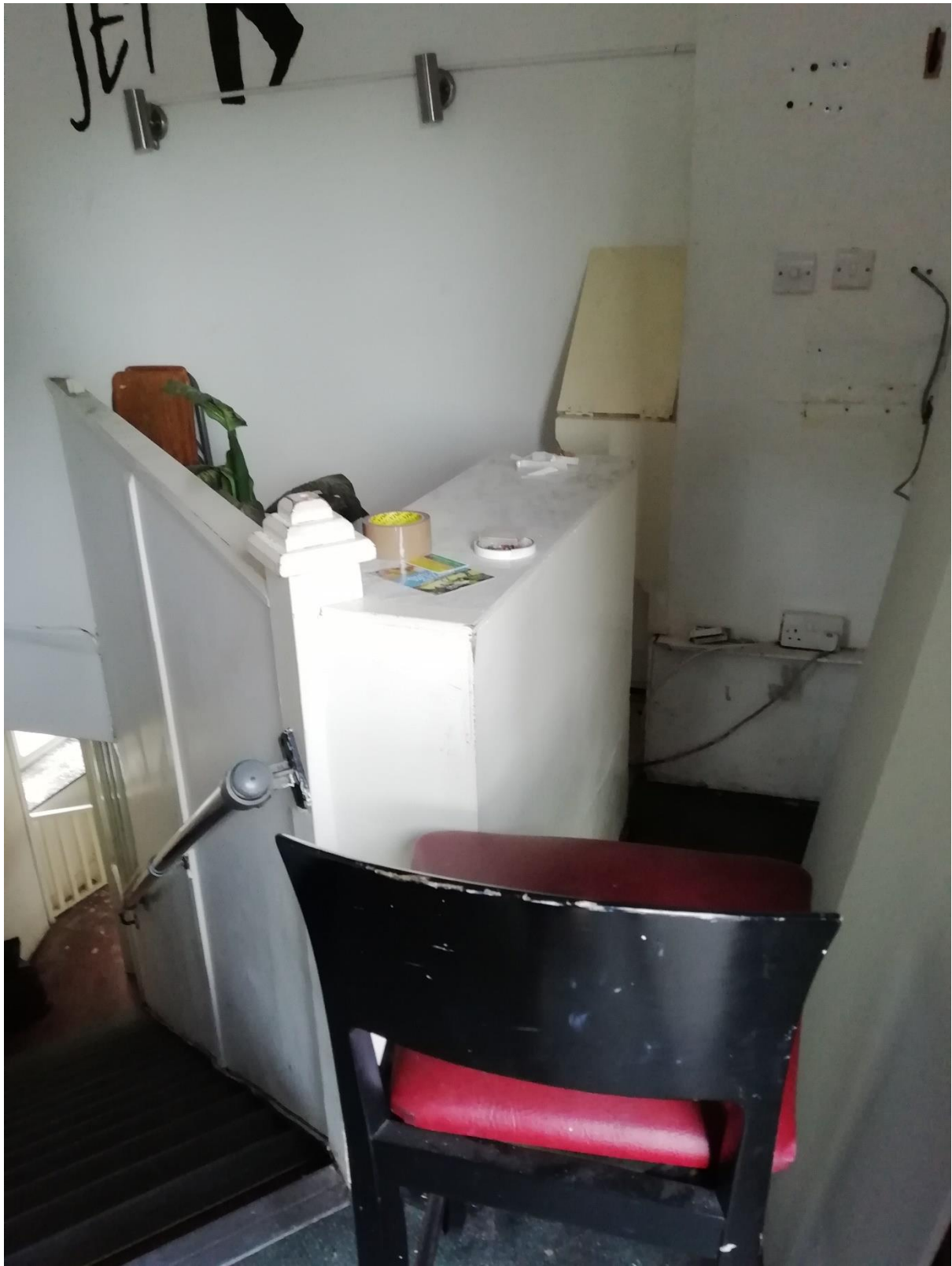
Reception area showing the narrow and steep stair in to the basement, main area of the venue.