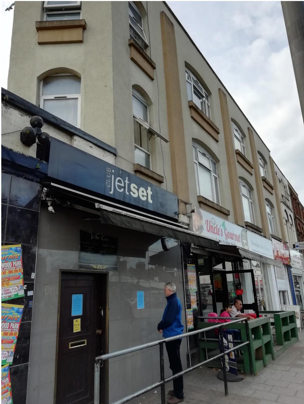
Photos taken 23/10/18 Outside the front with residential windows open above. Nuisance control; Officer standing in smoking area, this would also have to accommodate customers queuing to enter.