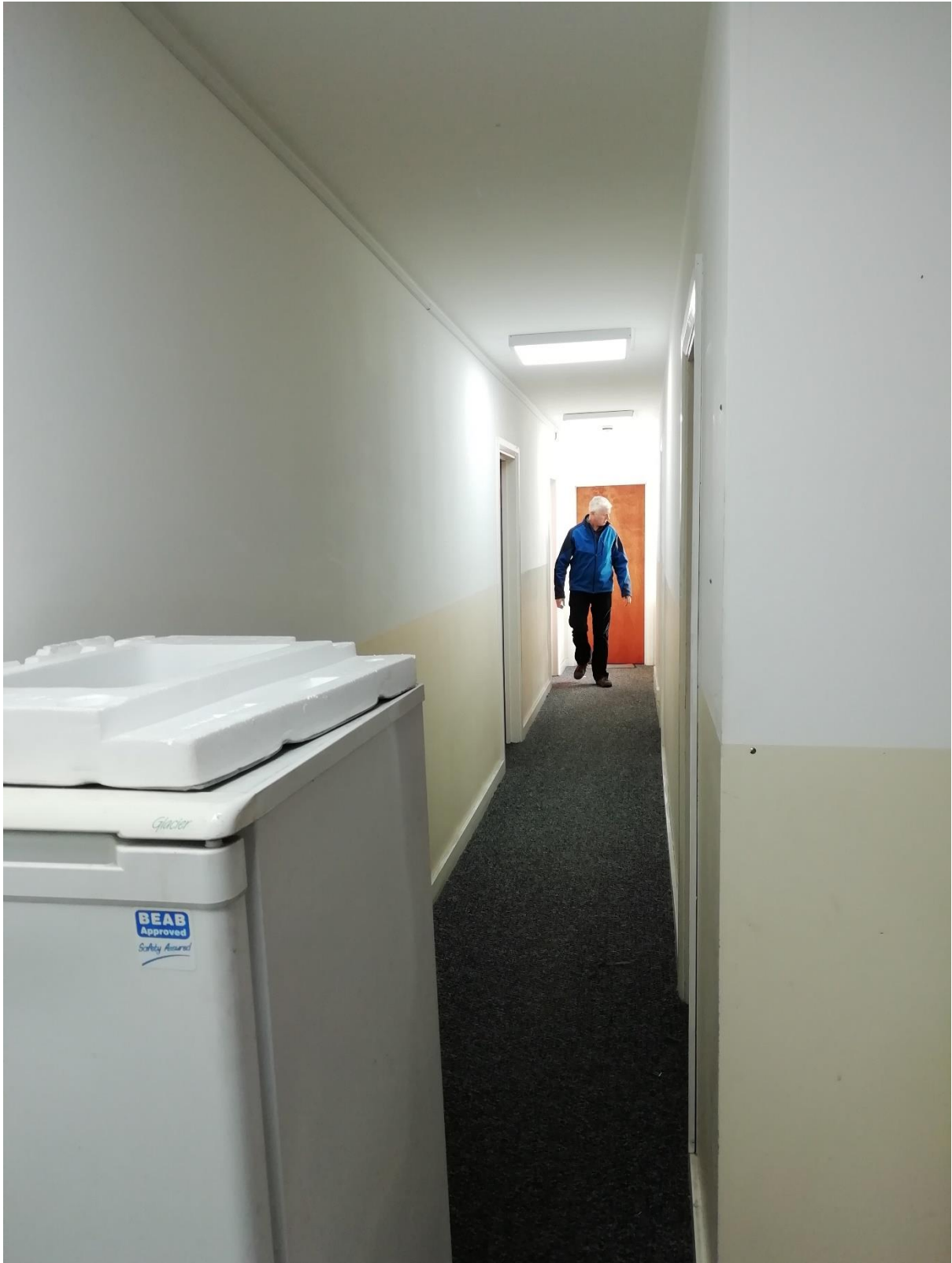
Residential flats two floors above the venue