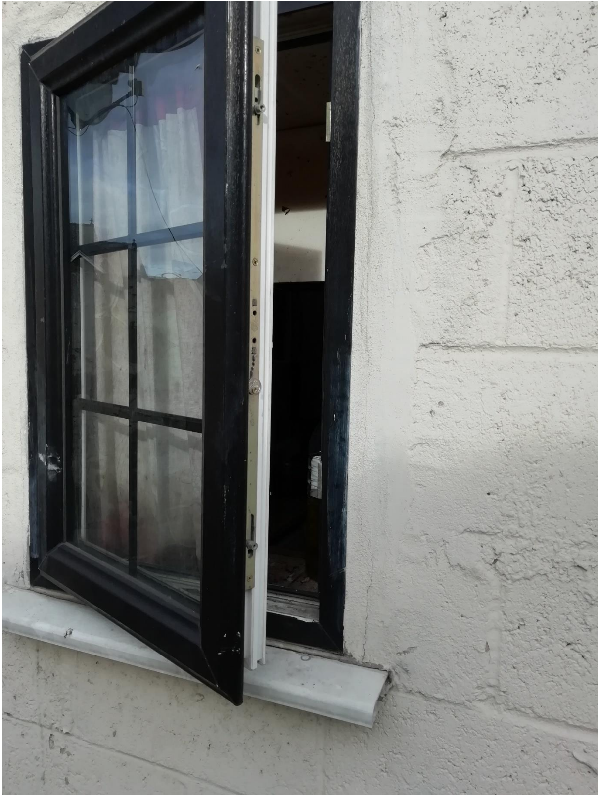
Residential window on ground floor, kitchen area