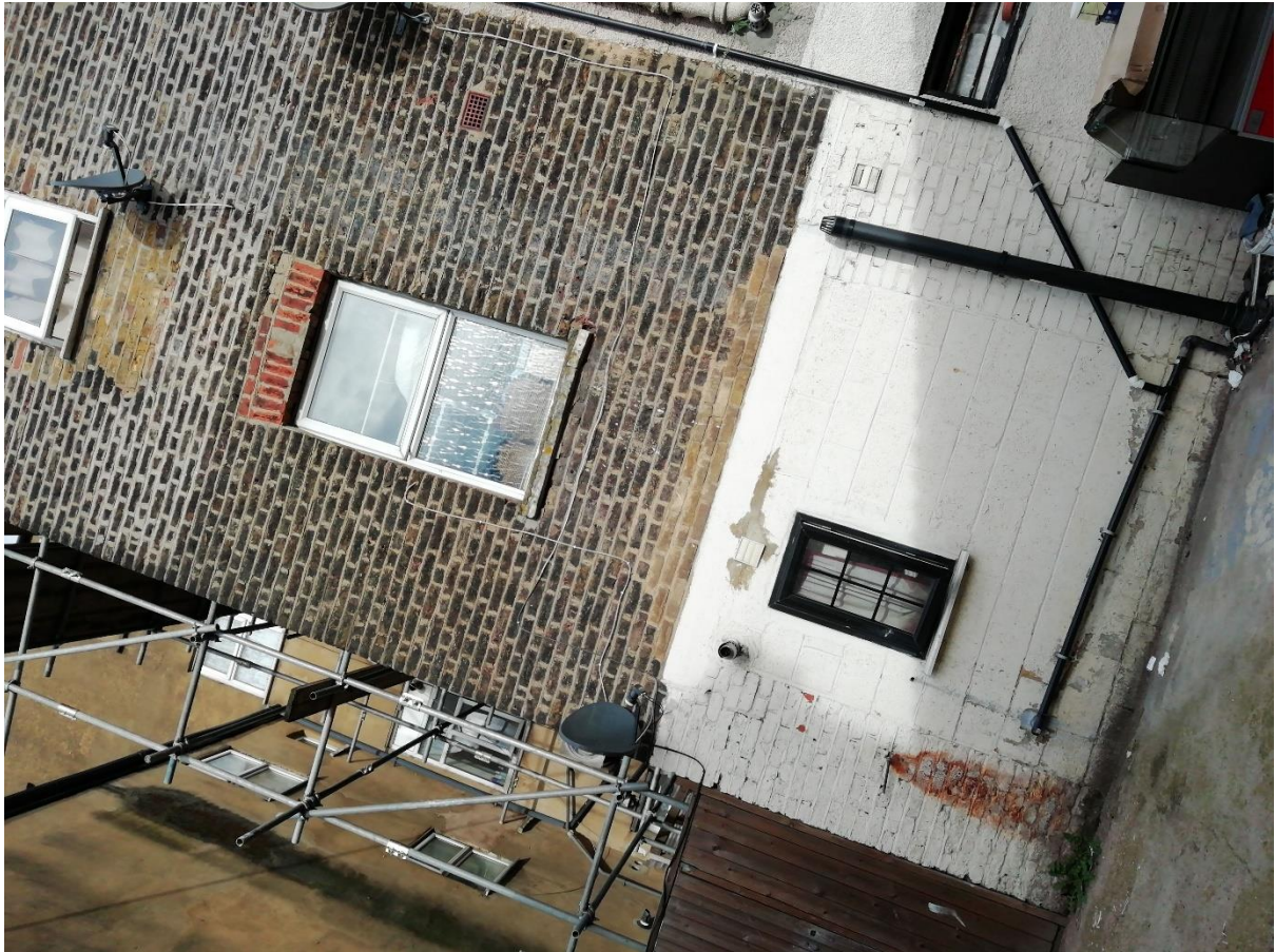
Residential properties rear of premises