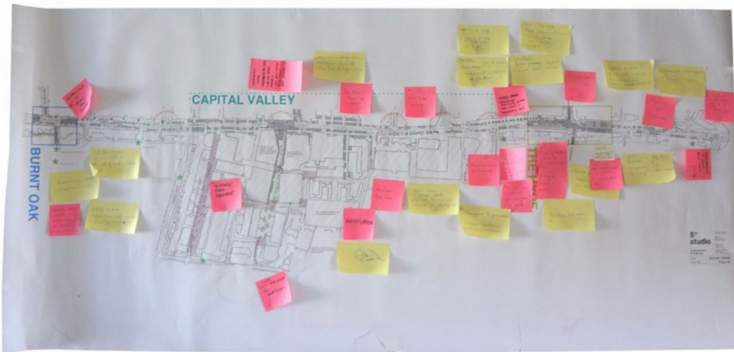
Left: Photographs of the diagrammatic plans displayed as part of the public consultation - with comments