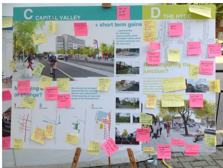
Left: Photographs of the three boards displayed as part of the public consultation - with comments