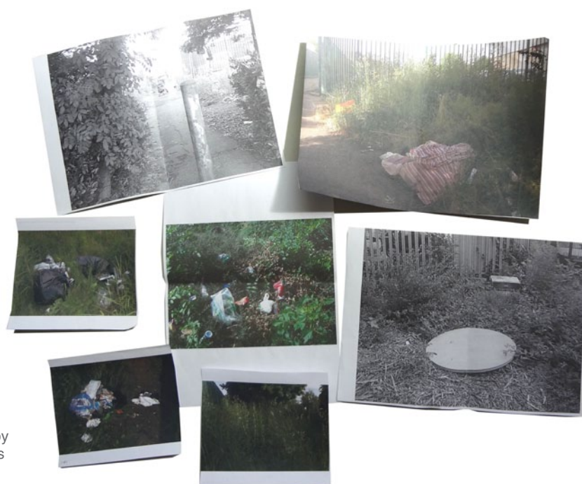
Right: Photographs given to the team during public consultation by a local resident to illustrate areas of concern