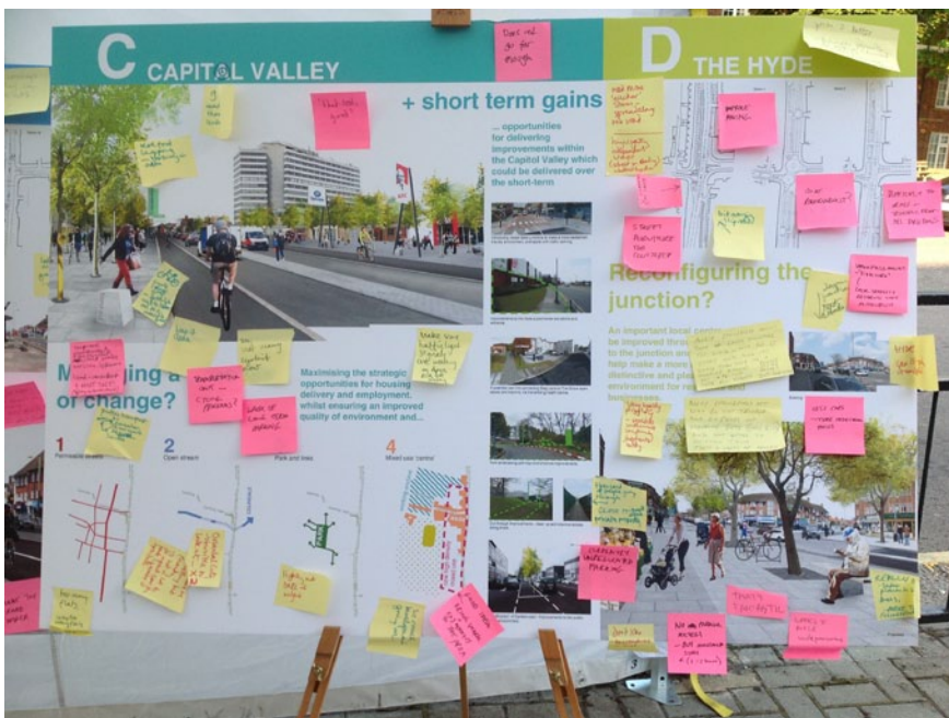
Left: Photographs of the three boards displayed as part of the public consultation - with comments