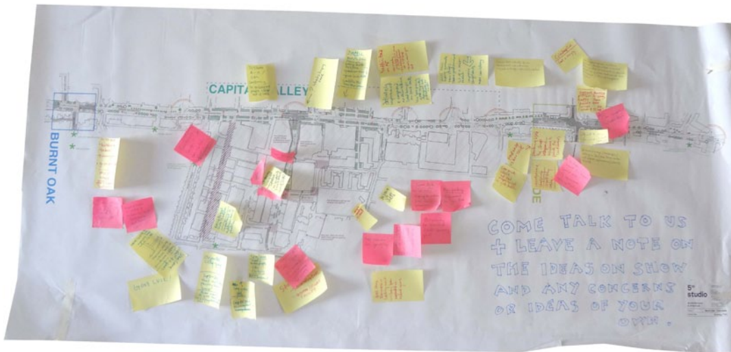
30 June - Asda - Queensbury Ward