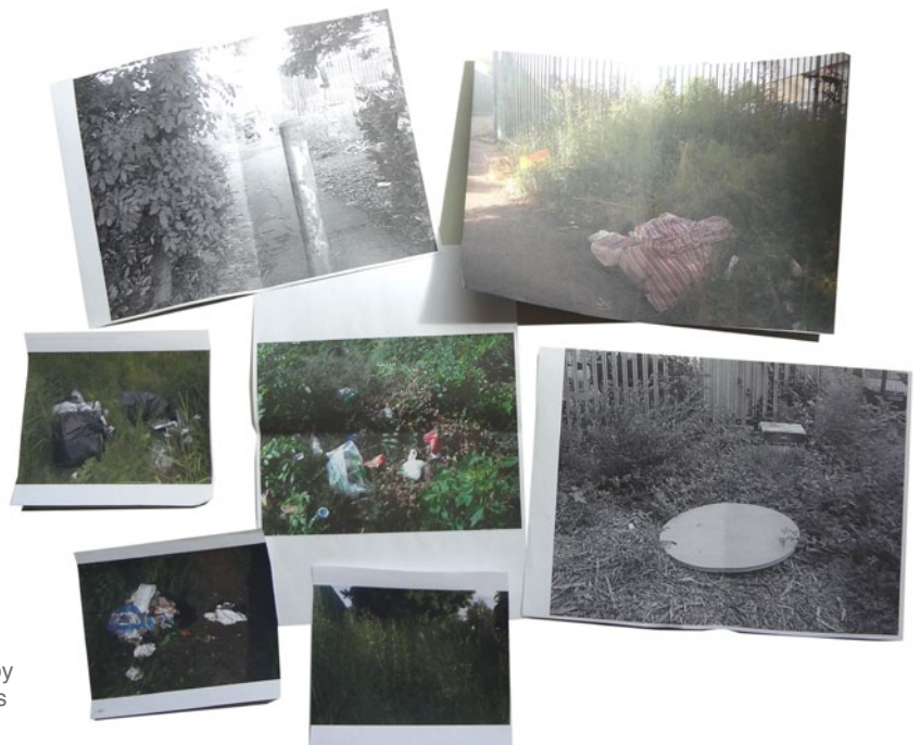
Right: Photographs given to the team during public consultation by a local resident to illustrate areas of concern