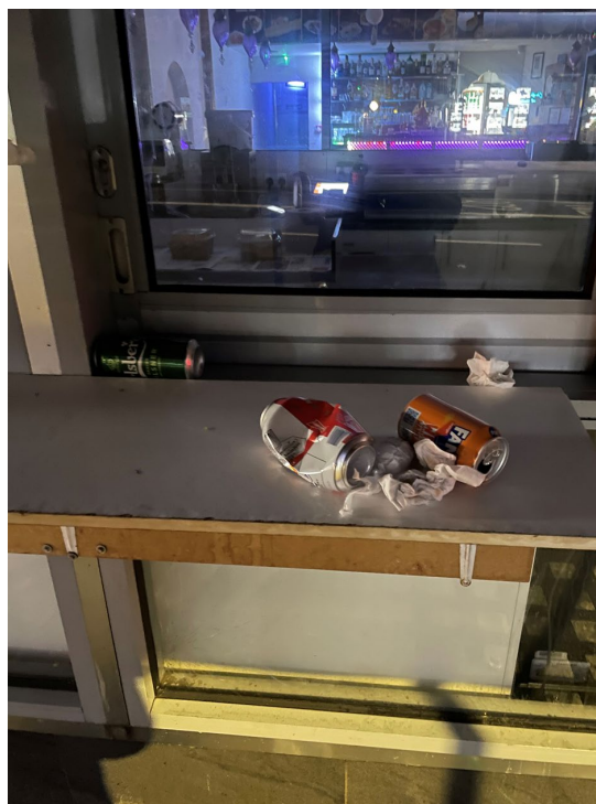
Discarded lager cans and other rubbish left behind.