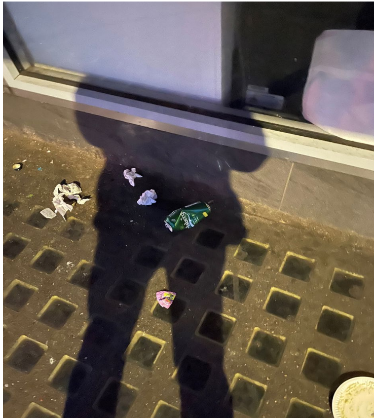
A discarded Carlsberg can with the label of Marla Cash & Carry on it