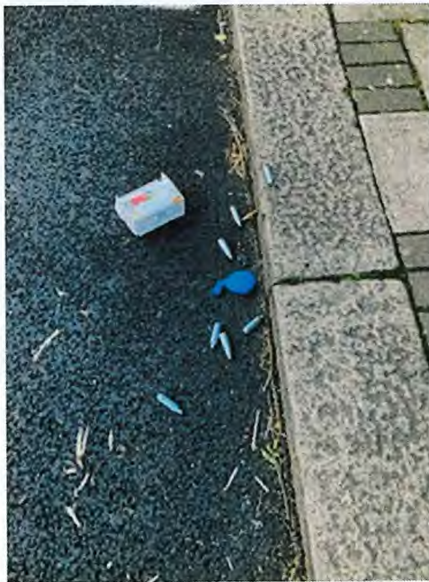
Day of action in Willesden Green tackling street drinking 28 January 2022 and attached picture of used nitrous oxide.