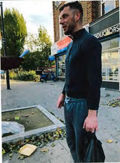
Willesden Green 21 April 2022. Multi-Agency Operation