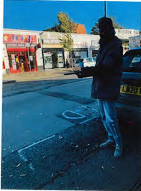
Neasden Town centre day of actions tackling street drinking and issuing FPN 7 January 2022