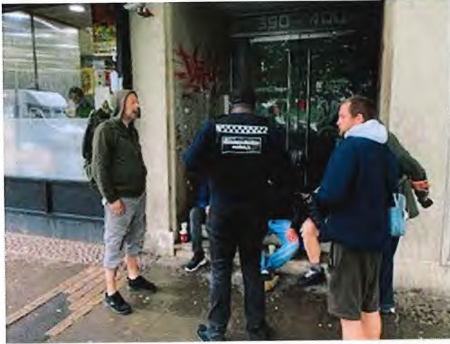
Homeless street drinkers on High Road, Wembley 18 June 2021