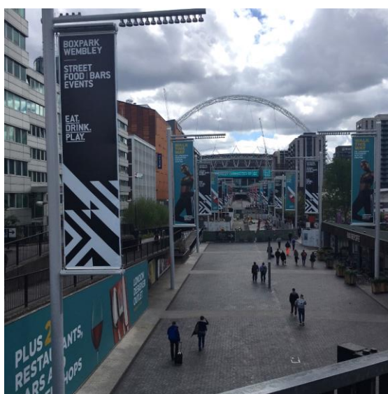
Olympic Way Resurfacing Works + Lamp Columns, April 2019

2.11 Public and private investment in significant improvements along Olympic Way involve a new treatment to the Bobby Moore Bridge, new hard and soft landscaping throughout, a new crossing at Fulton Road, new lighting, trees, street furniture, wayfinding, WIFI, a new public square, and replacement of the ‘pedway’ with substantial steps to create an iconic new entrance to the Stadium, which will create an environment where people will want to dwell before and after events.