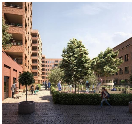
CGIs of entrance to Cecil Ave scheme and courtyard space