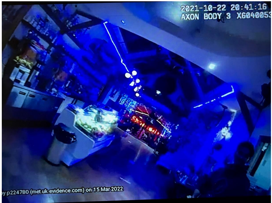
Police photo 4