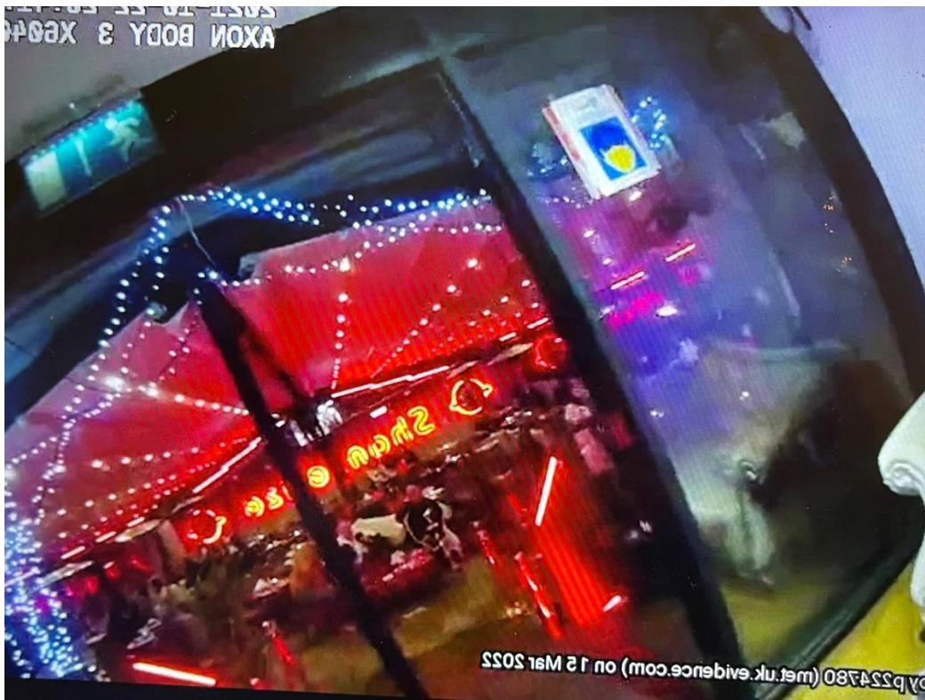
Police photo 5