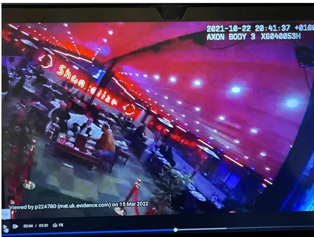
Police photo 6