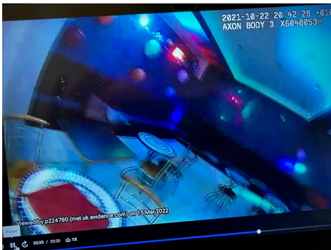
Police photo 7