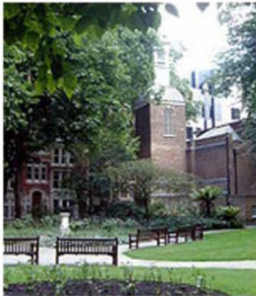
Postman's Park, EC1

Brent Council is working with Fortunegate Housing Association to regenerate Church End. The council has already consulted on these proposals, including building new homes on Mayo Road open space, to raise enough money to create a new park in the heart of Church End. The park is proposed on a third of St Mary's Cemetery (also known as Willesden Old Cemetery) and on housing amenity land fronting Church Road (see map).