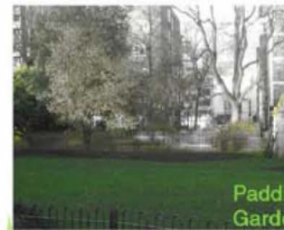
Paddington St. Gardens, London

The transformation of old cemeteries into parks has created some of the most well used parks and spaces in London. Some examples are illustrated on these pages. No graves will be disturbed to create the park.