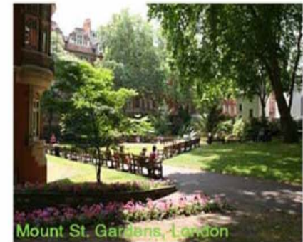
Mount St. Gardens, London

A new Multi-Use Games Area (MUGA) is proposed to be sited adjacent to St Mary's Primary School on disused open space. MUGAs are games areas that can be used for a variety of sports, in particular ball games. The facility on this site would be used by the school during school hours, and would be available for public hire outside of these hours and at weekends. Funds to build the MUGA have been secured through the Big Lottery Fund.