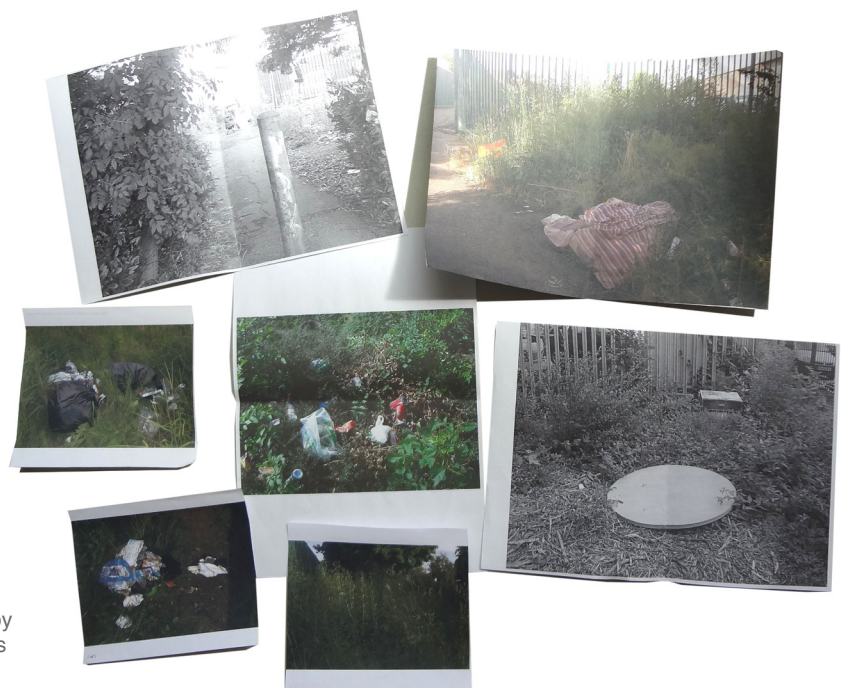
Right: Photographs given to the team during public consultation by a local resident to illustrate areas of concern