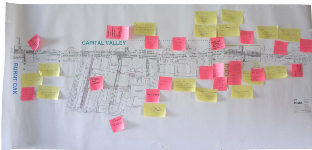
Left: Photographs of the diagrammatic plans displayed as part of the public consultation - with comments