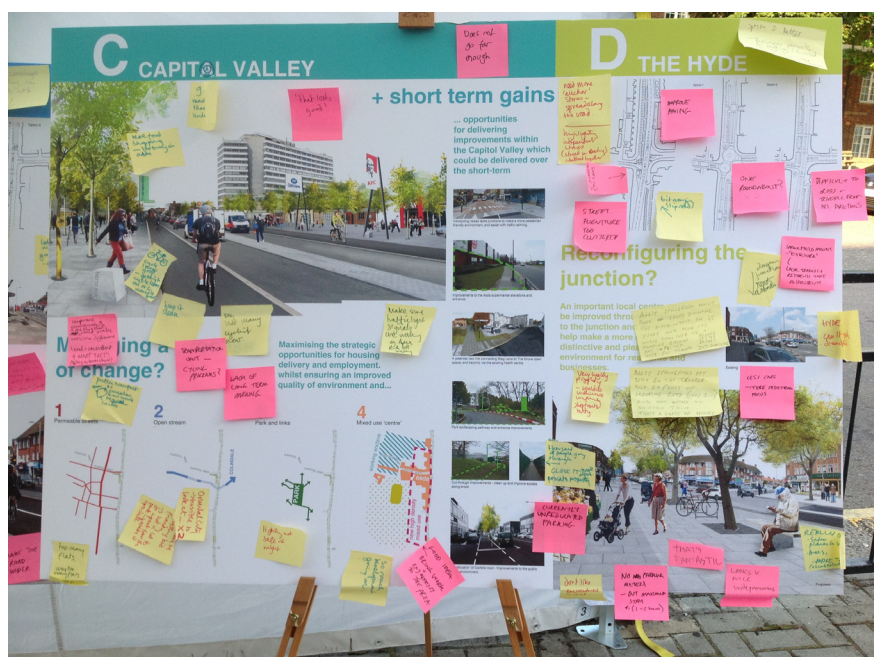
Left: Photographs of the three boards displayed as part of the public consultation - with comments