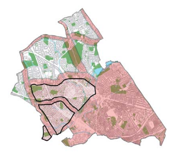
Figure 2: Plan of amended air quality management areas.