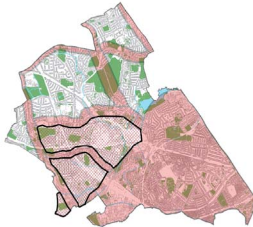
Figure 2: Plan of amended air quality management areas.